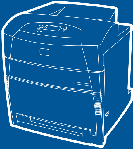
HP color LaserJet 5500/5550 Printers

For the complete PDF manual please visit www.LaserPros.com .